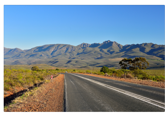
The HDM-4 has been used on a variety of major road networks, some stretching across multiple countries

The wide-scale use of HDM-4 has led to huge financial success for the Birminghambased consortium that manages its distribution: selling more than 1,440 software licenses and generating £1.6 million which is ploughed back into further research and development. As well as serving as an appraisal model, the HDM-4 is also a research tool in its own right. Birmingham researchers have been using it to investigate the potential impact of climate change on road deterioration and maintenance requirements, the damaging effects of corruption in the road sector, and the optimal design of pavements for tropical soils.